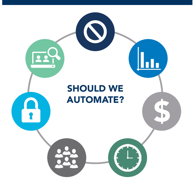
FIGURE 4: EVALUATING THE BENEFITS OF AUTOMATION

Figure 4 contains examples of factors that should be considered while evaluating whether a process should be automated. These factors would need to be weighed against each other based on the priorities of the organization and the RPA program.