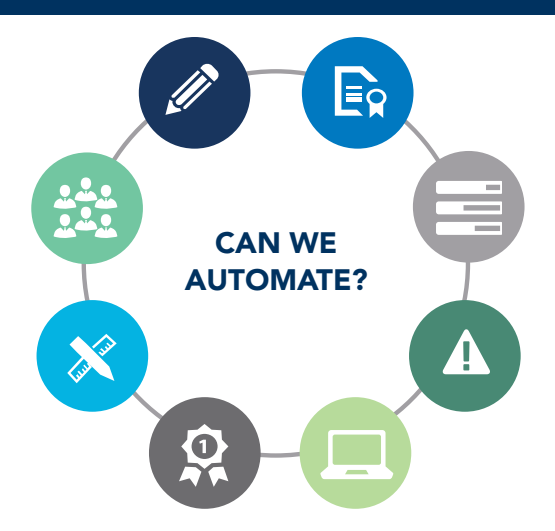
FIGURE 3: CHARACTERISTICS OF AN IDEAL AUTOMATION CANDIDATE

After asking some of these fundamental questions, decision makers should shift their focus to the business case, which should provide a summary of the opportunity, the proposed solution, and, most importantly, a list of the benefits. The types of benefits reaped from RPA can be broadly categorized into three buckets: efficiency and cost, effectiveness and quality, and risk and compliance.<sup>17</sup>